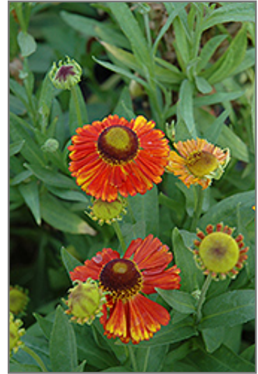
Sahin's Early Flowerer Sneezeweed flowers

This plant will require occasional maintenance and upkeep, and should be cut back in late fall in preparation for winter. It is a good choice for attracting butterflies to your yard, but is not particularly attractive to deer who tend to leave it alone in favor of tastier treats. Gardeners should be aware of the following characteristic(s) that may warrant special consideration;