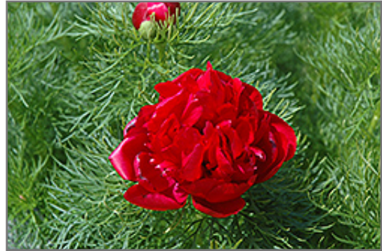
Double Fernleaf Peony flowers