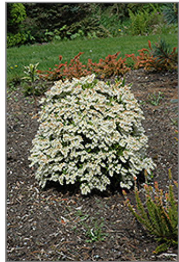
Prelude Japanese Pieris in bloom