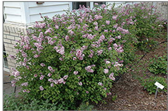
Prince Charming Lilac in bloom