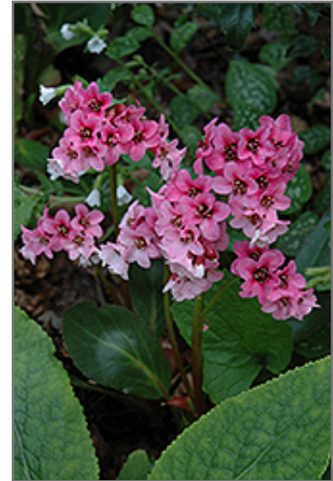
Pink Dragonfly Bergenia flowers