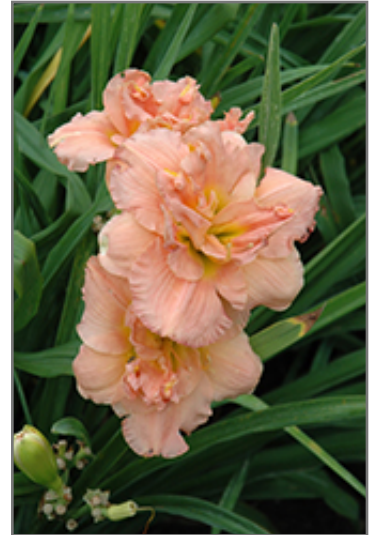
Siloam Double Classic Daylily flowers