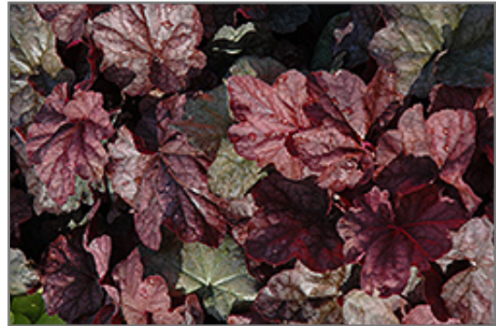
Beaujolais Hairy Alumroot foliage