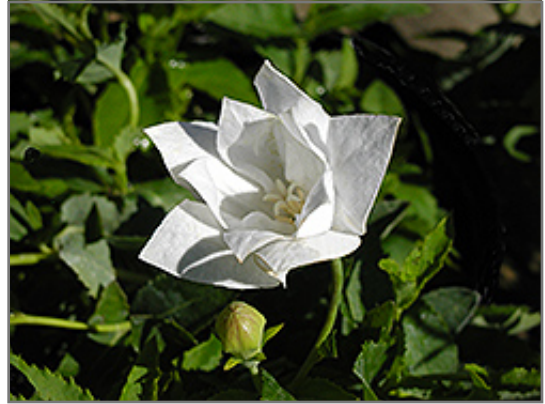
Hakone Double White Balloon Flower flowers

Hakone Double White Balloon Flower will grow to be about 18 inches tall at maturity extending to 24 inches tall with the flowers, with a spread of 18 inches. When grown in masses or used as a bedding plant, individual plants should be spaced approximately 15 inches apart. It grows at a medium rate, and under ideal conditions can be expected to live for approximately 10 years. As an herbaceous perennial, this plant will usually die back to the crown each winter, and will regrow from the base each spring. Be careful not to disturb the crown in late winter when it may not be readily seen!