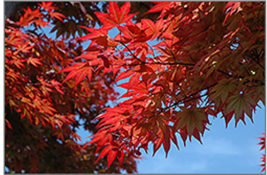
Oshio Beni Japanese Maple foliage

This tree does best in full sun to partial shade. You may want to keep it away from hot, dry locations that receive direct afternoon sun or which get reflected sunlight, such as against the south side of a white wall. It prefers to grow in average to moist conditions, and shouldn't be allowed to dry out. It is not particular as to soil pH, but grows best in rich soils. It is somewhat tolerant of urban pollution, and will benefit from being planted in a relatively sheltered location. Consider applying a thick mulch around the root zone in winter to protect it in exposed locations or colder microclimates. This is a selected variety of a species not originally from North America.