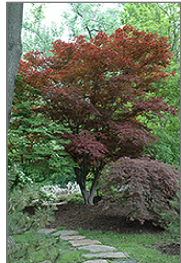
Oshio Beni Japanese Maple