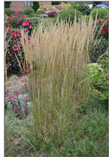
El Dorado Feather Reed Grass

El Dorado Feather Reed Grass is recommended for the following landscape applications;