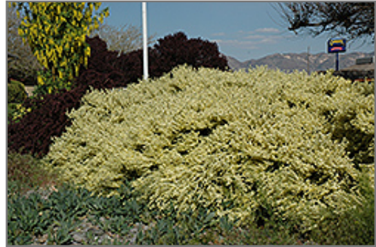
Moonlight Scotch Broom in bloom