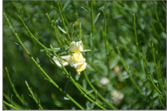
Moonlight Scotch Broom flowers

Moonlight Scotch Broom will grow to be about 5 feet tall at maturity, with a spread of 5 feet. It tends to fill out right to the ground and therefore doesn't necessarily require facer plants in front, and is suitable for planting under power lines. It grows at a medium rate, and under ideal conditions can be expected to live for approximately 20 years.