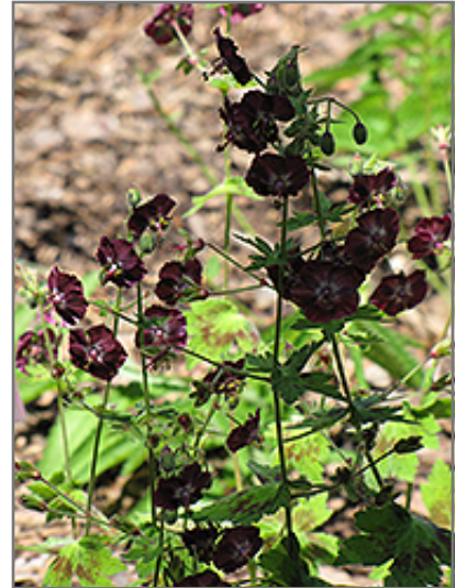
Samobor Cranesbill in bloom

Samobor Cranesbill is recommended for the following landscape applications;