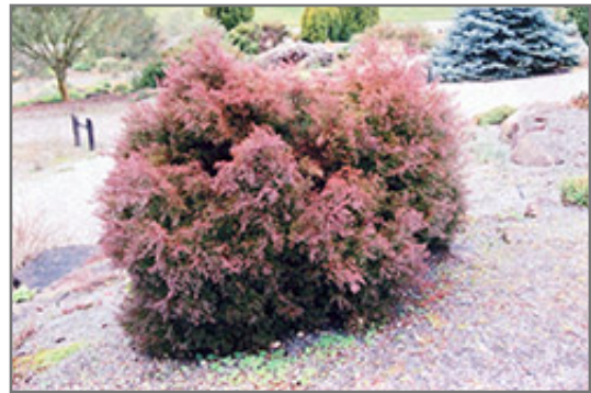
Ericoides Whitecedar in winter