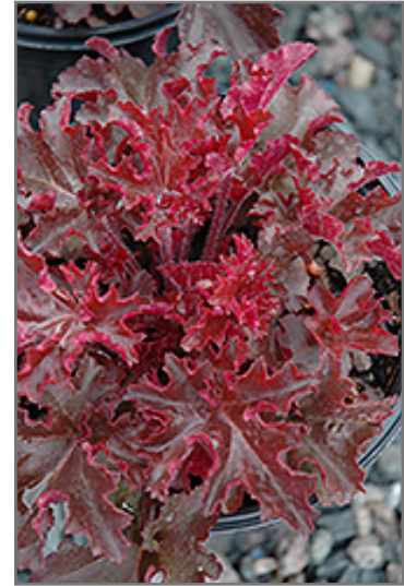
Melting Fire Coral Bells foliage

Melting Fire Coral Bells is recommended for the following landscape applications;