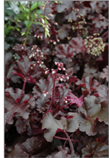
Melting Fire Coral Bells flowers

* This is a 'special order' plant - contact store for details