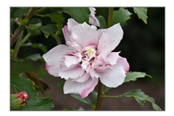
Lady Stanley Rose of Sharon flowers

Lady Stanley Rose of Sharon is recommended for the following landscape applications;