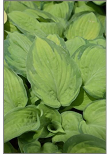
Paradigm Hosta foliage

Paradigm Hosta will grow to be about 10 inches tall at maturity extending to 18 inches tall with the flowers, with a spread of 4 feet. When grown in masses or used as a bedding plant, individual plants should be spaced approximately 4 feet apart. Its foliage tends to remain low and dense right to the ground. It grows at a medium rate, and under ideal conditions can be expected to live for approximately 10 years. As an herbaceous perennial, this plant will usually die back to the crown each winter, and will regrow from the base each spring. Be careful not to disturb the crown in late winter when it may not be readily seen!