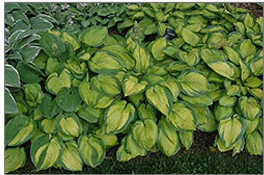
Paradigm Hosta