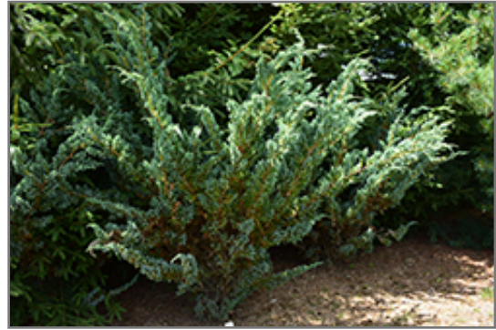
Meyer Juniper