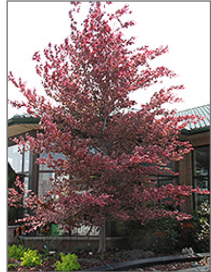
Tricolor Beech