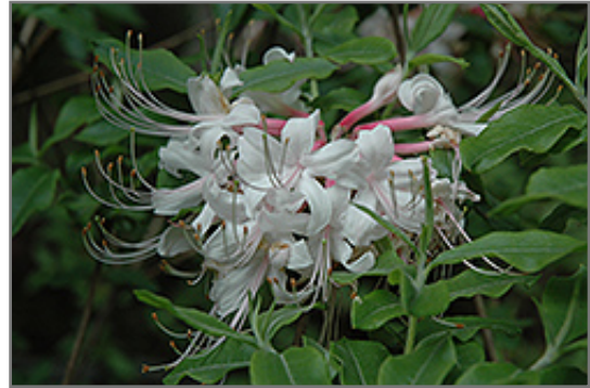
Nacoochee Azalea flowers

A dainty variety with white blooms with a hint of pink covering the branches in mid spring; showy when massed in a border or as a garden accent; absolutely must have well-drained, highly acidic and organic soil, use plenty of peat moss when planting