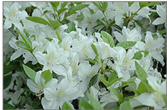
Palestrina Azalea flowers