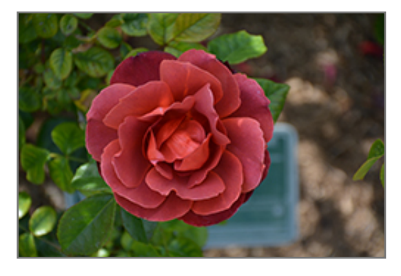
Hot Cocoa Rose flowers