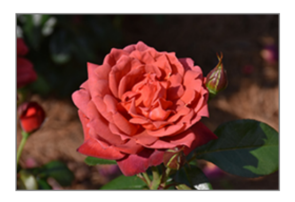
Hot Cocoa Rose flowers

361 N. Hunter Highway Drums, PA 18222 (570) 788-4181 www.beechwood-gardens.com