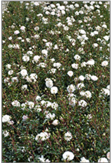
Sea Foam Rose in bloom