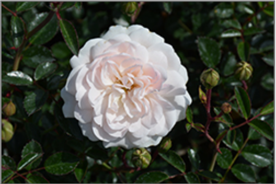
Sea Foam Rose flowers

This shrub will require occasional maintenance and upkeep, and is best pruned in late winter once the threat of extreme cold has passed. It is a good choice for attracting bees to your yard. Gardeners should be aware of the following characteristic(s) that may warrant special consideration;