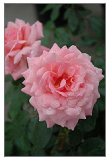
Sexy Rexy Rose flowers