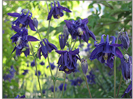
Double Violet Blue Columbine flowers

Double Violet Blue Columbine is recommended for the following landscape applications;