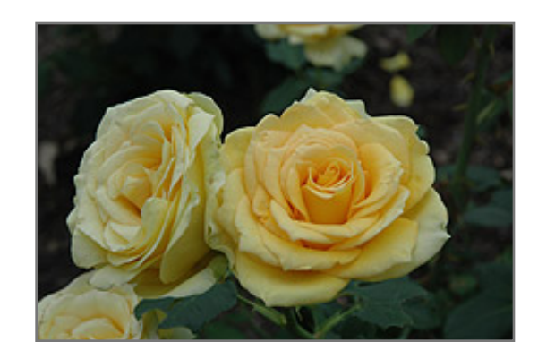
Limelight Rose flowers

Limelight Rose features showy lightly-scented fully double yellow flowers with green edges at the ends of the branches from early summer to early fall. The flowers are excellent for cutting. It has attractive dark green deciduous foliage which emerges red in spring. The oval compound leaves are highly ornamental and turn yellow in fall.