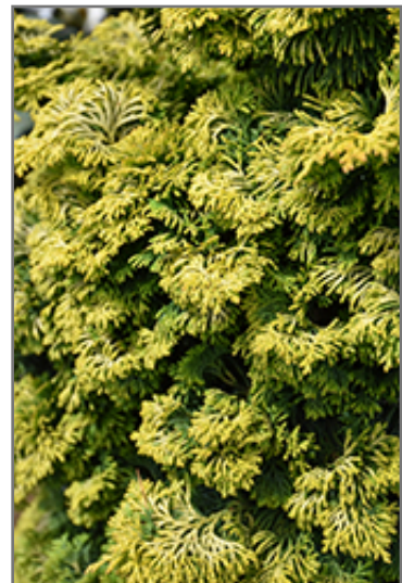
Dwarf Golden Hinoki Falsecypress foliage