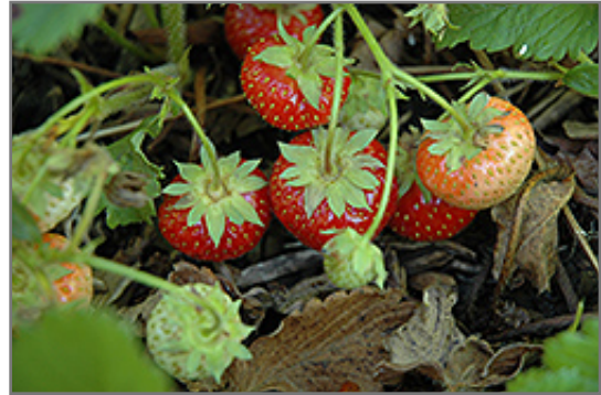
Common Wild Strawberry

Common Wild Strawberry features dainty white cup-shaped flowers with yellow eyes along the stems from late spring to early summer. Its attractive tomentose round compound leaves remain green in color throughout the season. It features an abundance of magnificent cherry red berries from late spring to late summer.