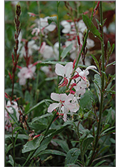
Ballerina Blush Gaura flowers

Ballerina Blush Gaura is recommended for the following landscape applications;