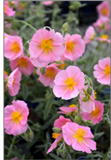
Wisley Pink Rock Rose flowers

Wisley Pink Rock Rose is recommended for the following landscape applications;