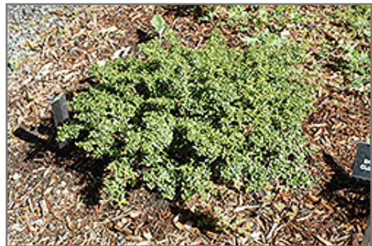
Lemon Gem Dwarf Japanese Holly