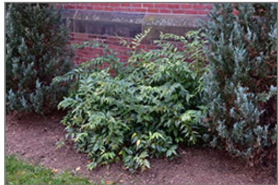
Rainbow Fetterbush