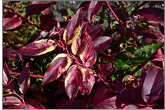
Rainbow Fetterbush in fall

* This is a 'special order' plant - contact store for details