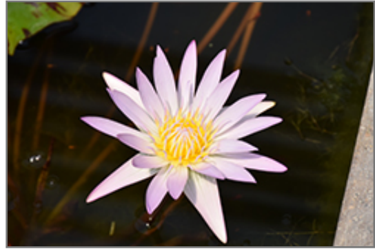
Madame Ganna Walska Tropical Water Lily flowers