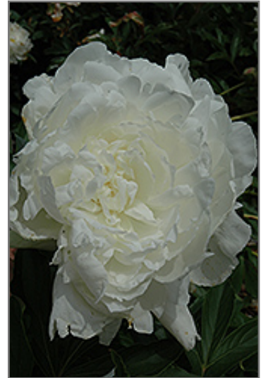
Ann Cousins Peony flowers