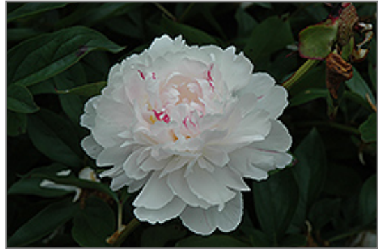
Bertrade Peony flowers