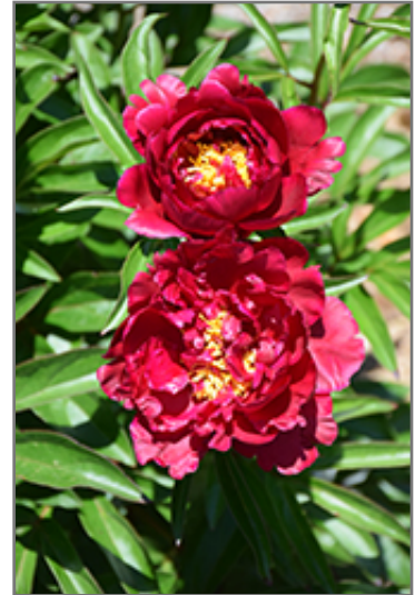
Cherry Hill Peony flowers