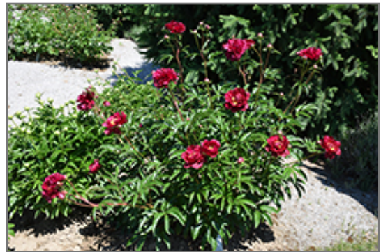
Cherry Hill Peony in bloom