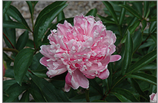
Clemenceau Peony flowers