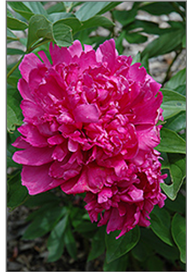
David Harum Peony flowers