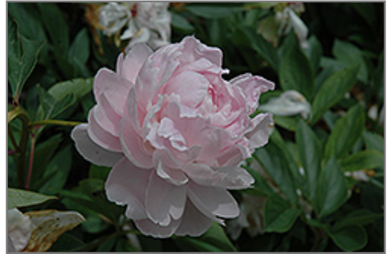
Edwin C. Shaw Peony flowers