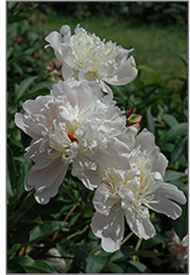
Fanny Crosby Peony flowers