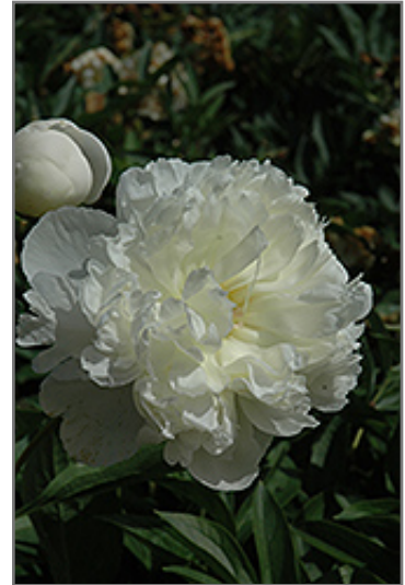
Golden Dawn Peony flowers