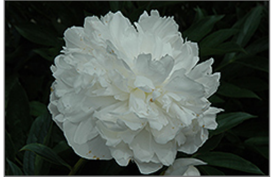
Grace Loomis Peony flowers