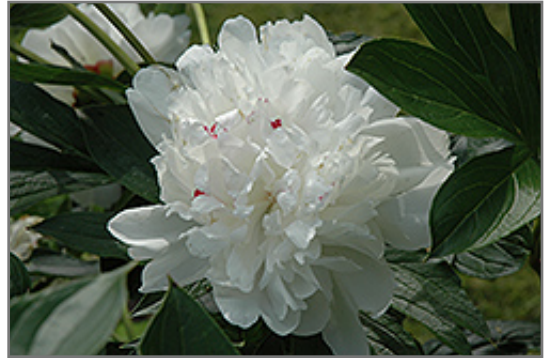
Grandiflora Nivea Plena Peony flowers