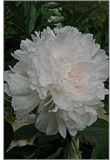
Jeannot Peony flowers