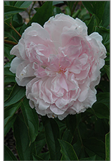
La France Peony flowers