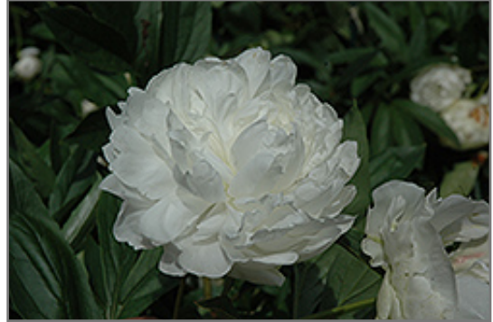
Le Cygne Peony flowers

This early double peony is ivory white when it opens then matures to pure white; the blooms are compact and beautifully shaped; its large flowers are mildly fragrant and fairly abundant