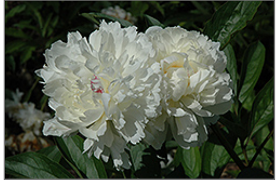
Monsieur Dupont Peony flowers