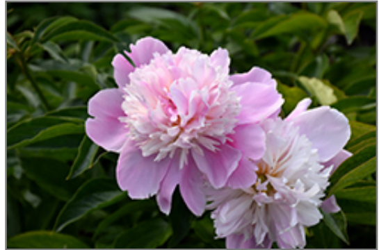
Monsieur Jules Elie Peony flowers