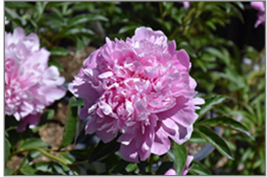
Monsieur Jules Elie Peony flowers