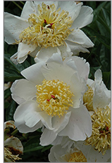
Polar Star Peony flowers