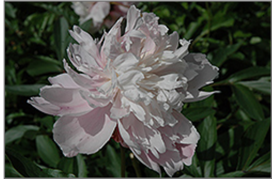
Simonne Chevalier Peony flowers