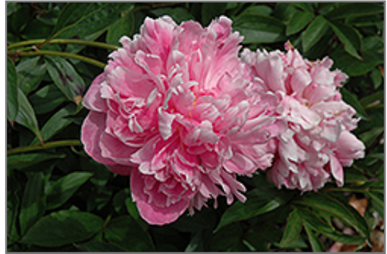
Souvenir de Louis Bigot Peony flowers